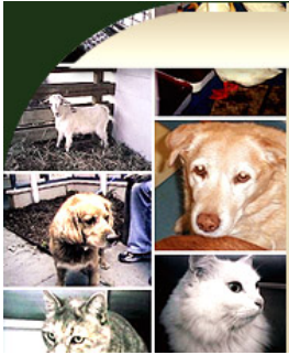
Cats, Dogs, and Ferrets! All can get a rabies shot at the Fairfax County Animal Shelter