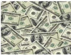
Dues remain at $75 per year.

The annual dues statements were mailed out in February and are now overdue. Our budget for this year is planned to be about the same as last year so we've kept the dues at $75.00. If you haven't put them in the mail yet, then there is an additional $5.00 for every 30 days the dues are late.